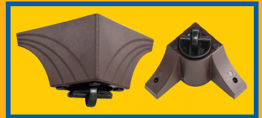
PRODUCT CODE: CHOCOLATE BROWN