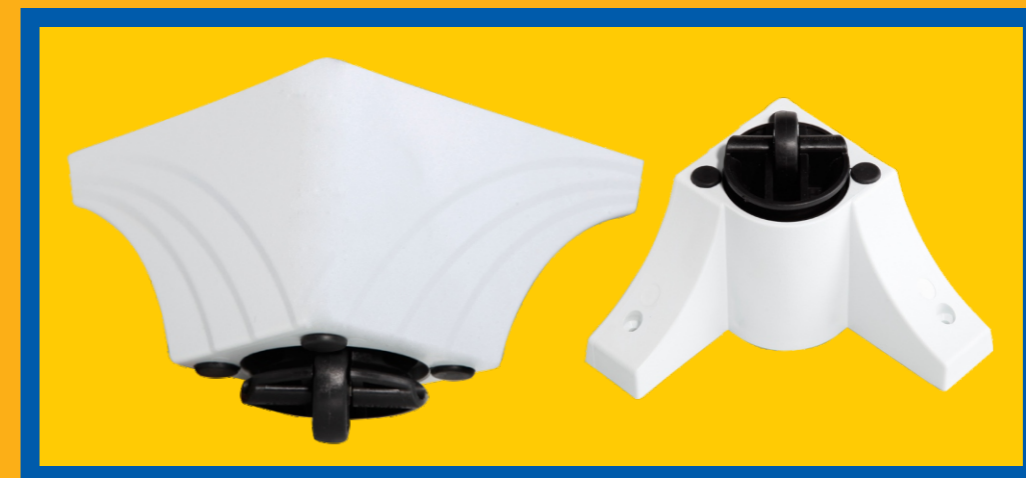
PRODUCT CODE: GLACIER WHITE