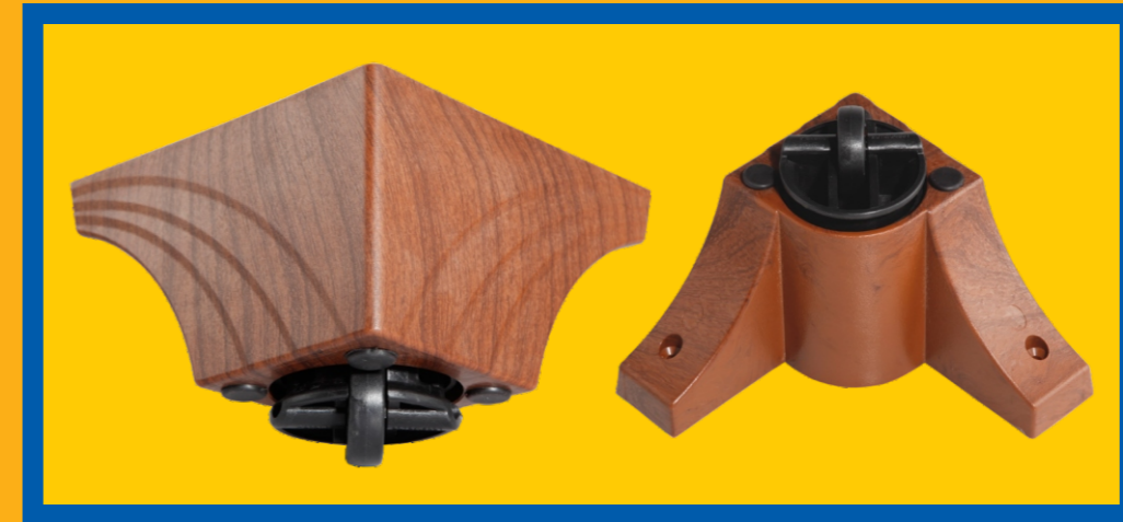
PRODUCT CODE: WOOD FINISH